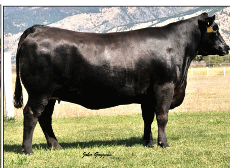
HOFF BLACKBIRD 5217 - dam of Raff Blackbird F14. She is also the dam of stud sires Raff Dakota D85, Raff Dynamite D345, Raff Dazzler D353, Raff Explosive E108 & Raff Ego E266. Her leading daughter Raff Blackbird D349 was the 2012 Brisbane Royal Show Supreme Champion Interbreed Female. Sons have sold to $20,000 and daughters to $16,000.