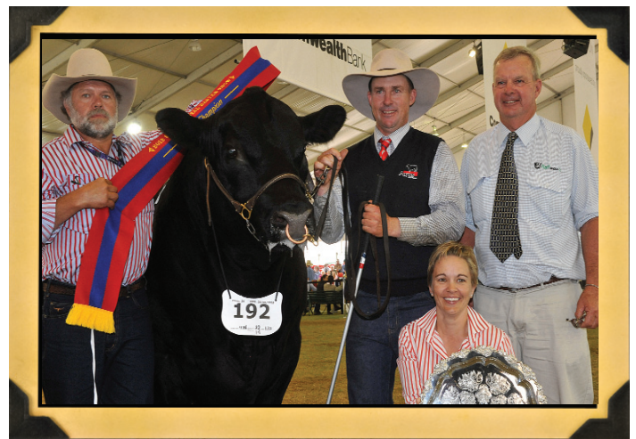
TOP RIGHT: Raff Empire E269 ~ 2012 Sydney Royal Show Senior & Grand Champion Angus Bull.