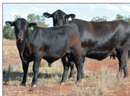
RAFF BLACKBIRD F14 - dam of Raff Kingdom K76. Blackbird is pictured at 4 ¾ years of age weighing 1216kgs. Kingdom was 8 months old when the photo was taken.