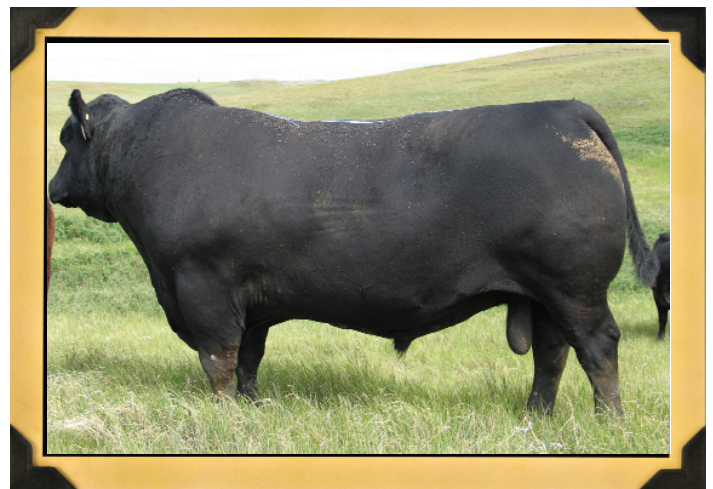
BOTTOM RIGHT: Hoff Limited Edition SC594 - all time high income earning sire that broke all Raff records.