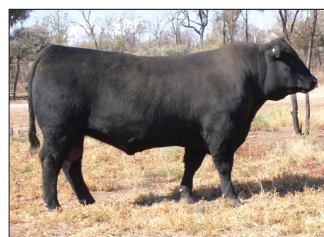
J & C APPEAL A10 - sire of Raff Empire E269. Appeal sons excelled for weight for age and dominated the sale ring for consistently achieving high sale prices topping at $18,000 twice.