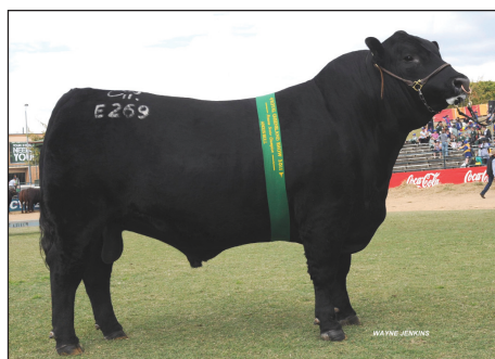
RAFF EMPIRE E269 - sire of Raff Kingdom K76. Empire is pictured at 23 months weighing 1150kg with a whole of life daily weight gain of 1.55kg/day. During his show career he was undefeated on the country show circuit across Australia earning a total of 11 Interbreed Supreme Beef Exhibit titles over a two year period including the Melbourne Royal Angus Feature Show.

What better way to celebrate our fiftieth year of Angus Seedstock production than to breed our highest weight gaining bull ever. Raff Kingdom K76 born 17/03/14 was weaned at 300 days weighing 660kgs giving him an adjusted whole of life daily weight gain of 2.05 kg/day. Kingdom is sired by our 10th generation show sensation sire Raff Empire E269. His dam, Raff Blackbird F14, resulted from an embryo imported from one of the four Hoff Scotch Cap females purchased at their dispersion sale in 2006. She is pictured below weighing 1216kgs at 4 ¾ years of age.